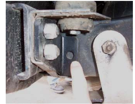
Step 5 thru 8 TJ reference