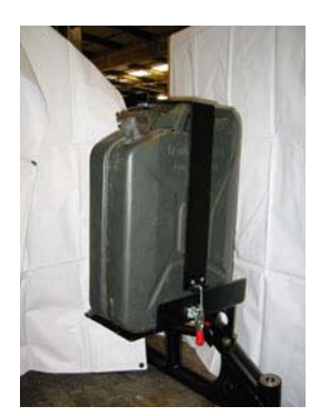
Final Set-Up Step 6