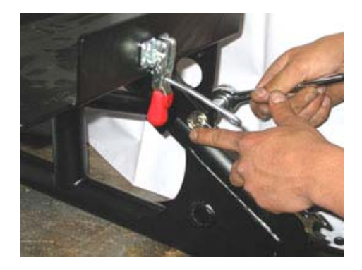
Installation Step 5