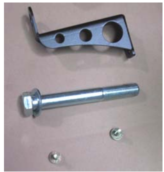
Figure 2: Stiffener Bracket & Hardware