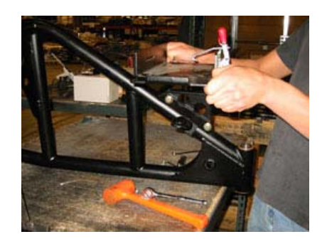
Installation Step 3 Figure 1