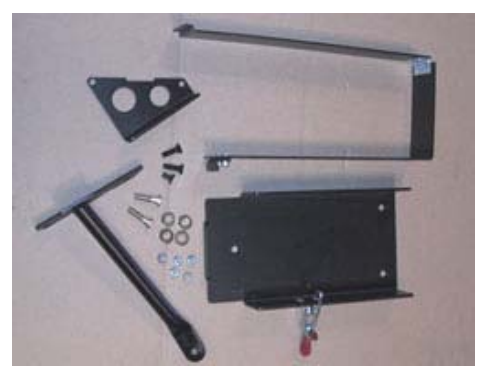
Figure 7: Gas Can Mount Kit (old brace shown, new brace is "boomerang" shaped)