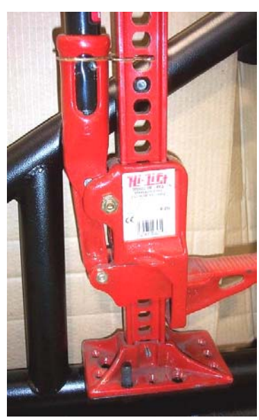
Hi-Lift Mount Step 2 and 3