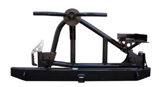
Figure 1: Bumper/Swing-out Assembly