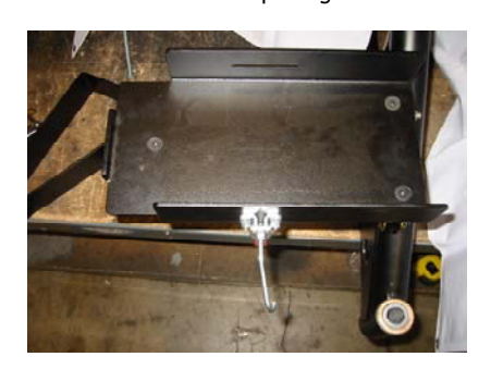
Installation Step 3 Figure 2