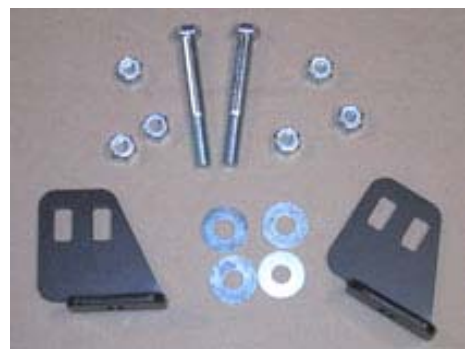
Figure 4: YJ Frame Bracket Kit