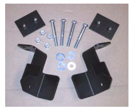
Figure 3: TJ Frame Bracket Kit