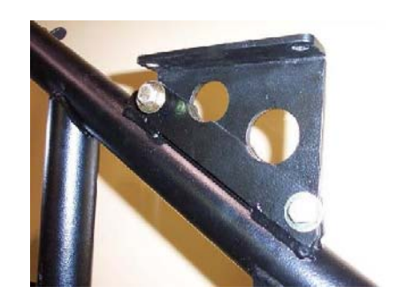
Installation Step 2 Figure 1